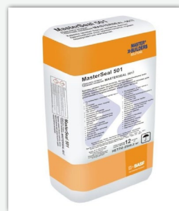
Master Seal 501 Crystalline Water Proof Coating