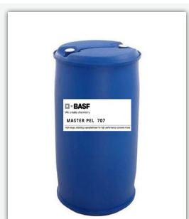
Master Pel 707