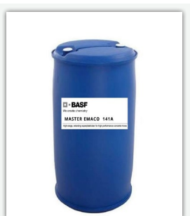
Master Emaco 141A