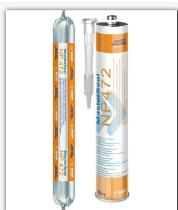
MasterSeal NP472 Polyurethane Sealant