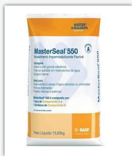
Master Seal 550 Cementitious Water Proof Coating