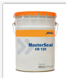
MasterSeal CR125 Self-Leveling Polyurethane Sealant