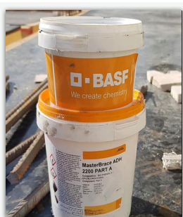
MasterBrace ADH 2200