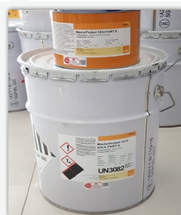
Master Protect 1812 Protection from Waste Water