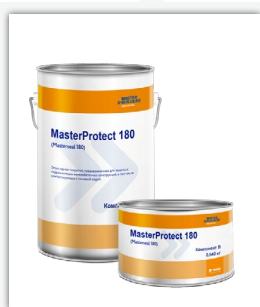
Master Protect 180 Protection from Bacteria